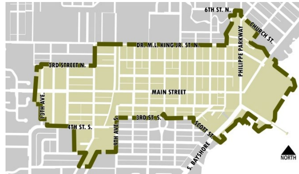
Downtown Safety Harbor CRD

After the permit is approved, businesses may place café tables and associated equipment (chairs and umbrellas) on sidewalks located within the Community Redevelopment District (CRD) boundary shown below.